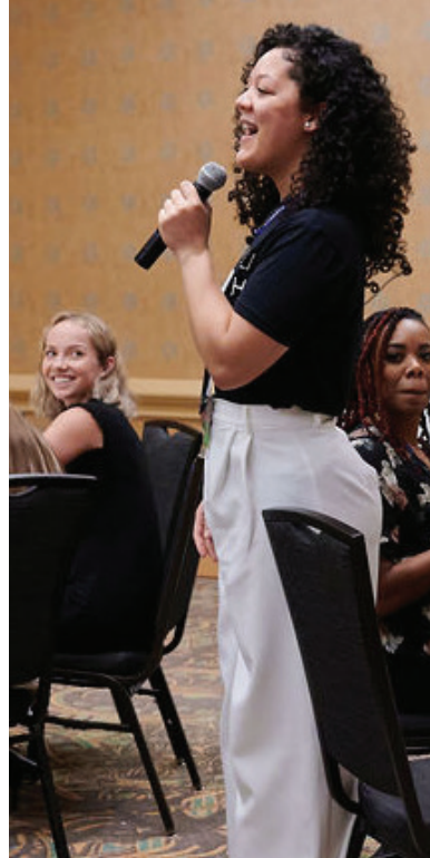
Igniting Passion. Transforming Lives.